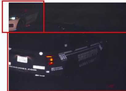
Plate TX 1573961 Date 4/5/2024, 12:08:37 AM Location #01 - White Oak Springs Dr - Inbound

Plate TX MVK4961 Date 4/5/2024, 12:09:12 AM Location #01 - White Oak Springs Dr - Inbound