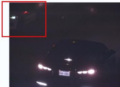
Plate TX MVK4961 Date 4/5/2024, 12:09:12 AM Location #01 - White Oak Springs Dr - Inbound

Plate TX RXH9128 Date 4/5/2024, 12:09:19 AM Location #01 - White Oak Springs Dr - Inbound