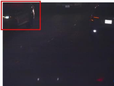
Plate TX RXH9128 Date 4/5/2024, 12:09:19 AM Location #01 - White Oak Springs Dr - Inbound