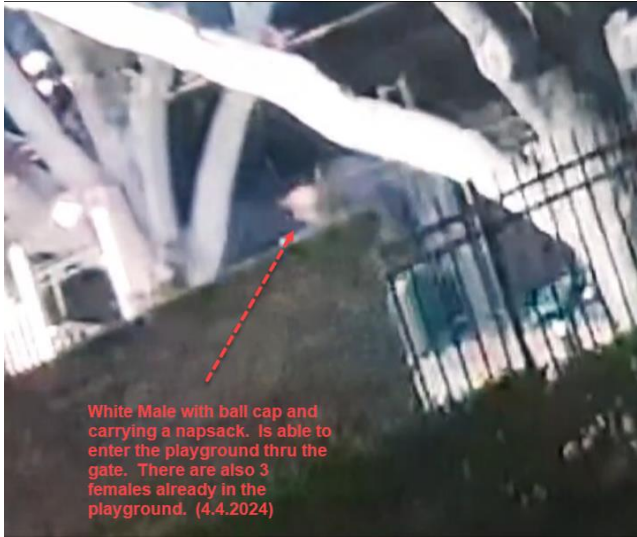
White Male with ball cap and carrying a napsack. Is able to enter the playground thru the gate. There are also 3 females already in the playground. (4.4.2024)