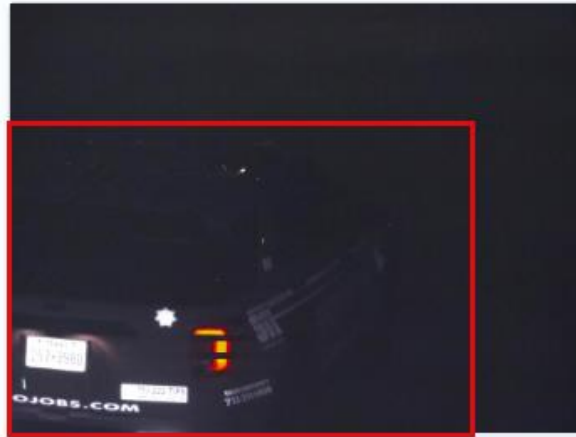
Plate TX 1573980 Date 4/4/2024, 11:43:44 PM Location #01 - White Oak Springs Dr - Inbound