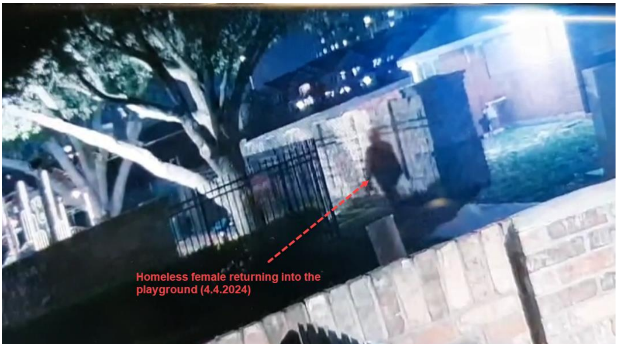
Homeless female returning into the playground (4.4.2024)